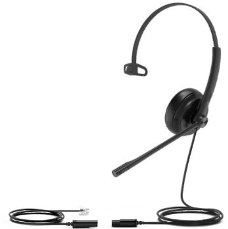
YHS34/YHS34 Lite Mono

Built for comfort with soft ear cushions and ultra-lightweight materials, the YHS34/YHS34 Lite is 10%~30% lighter than other headsets in the same range. Its ergonomic design makes this headset comfortable enough for long conference calls and all day use.