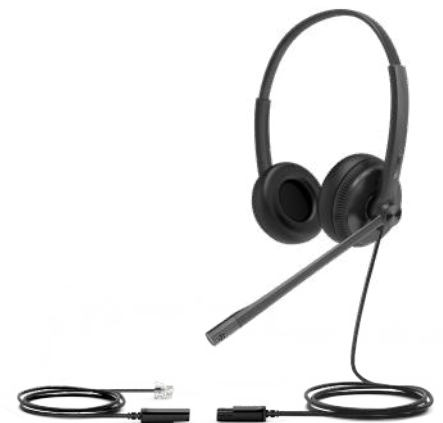
YHS34/YHS34 Lite Dual